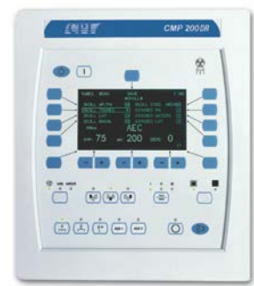
CPI CMP 200DR HF Generator Console